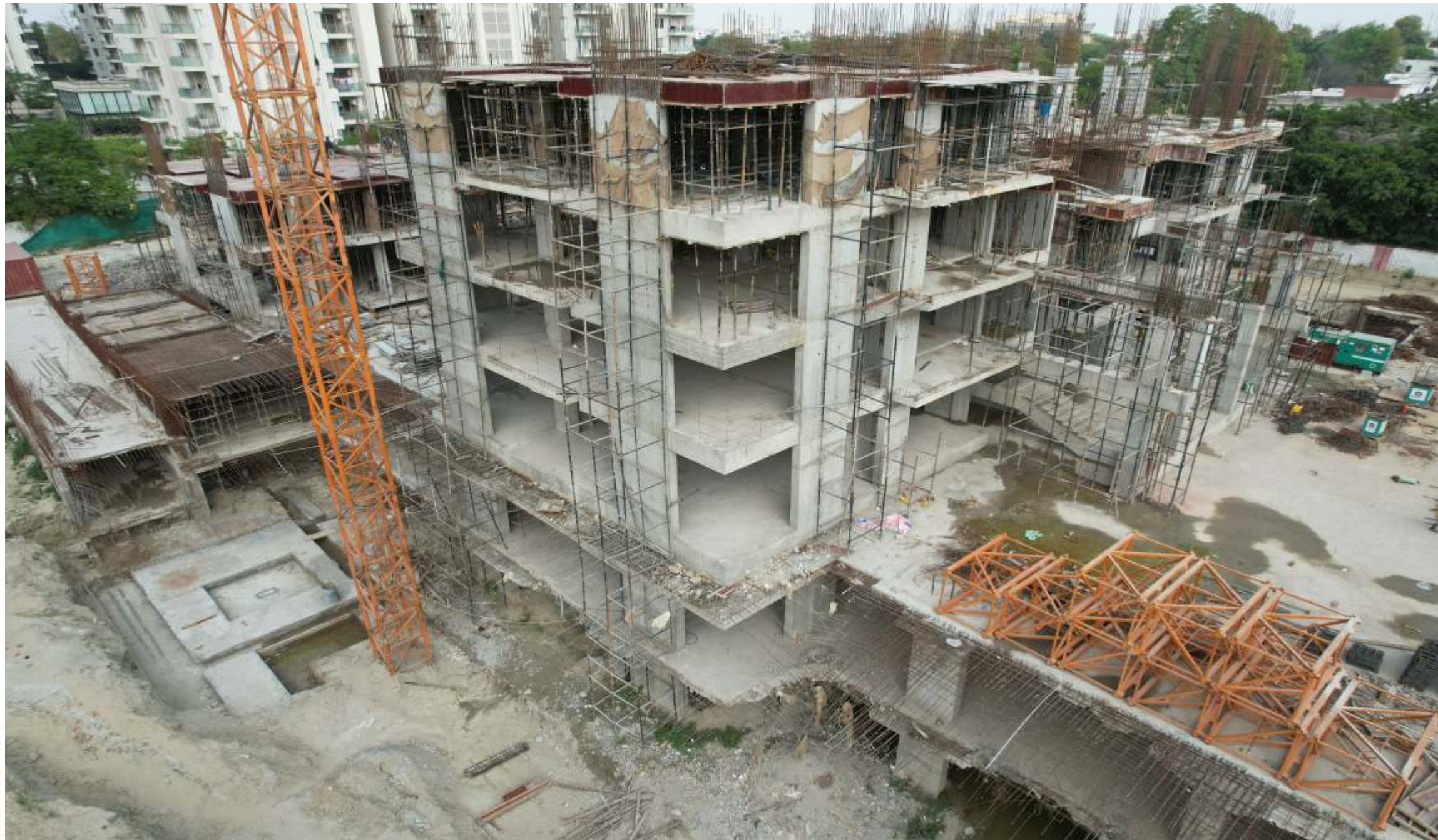
TOWER - A