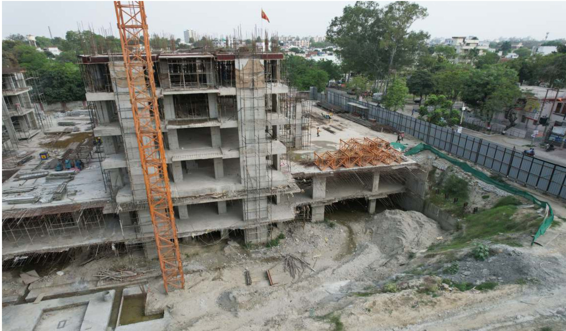
TOWER - B